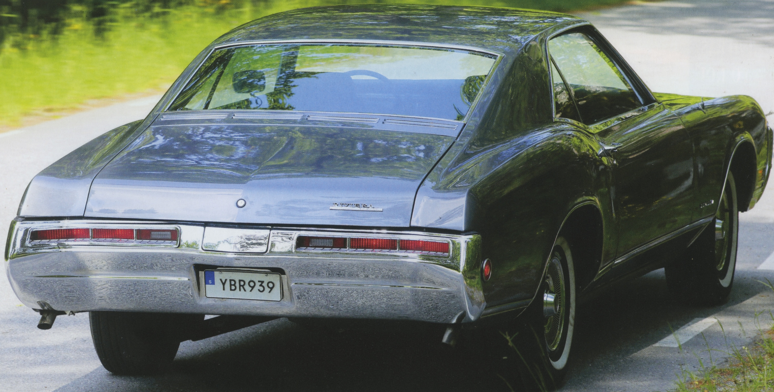
The 1969 Riviera, Series 49400, V-8, #49487, 4,199 lbs, 52,872 produced, listed at $4,701.

included was an original registration form issued by the California DMV, on 04/04/69, to Frank Wayne Sinatra Jr. at Fox Hill Drive in Los Angeles on a 1969 Buick. The VIN in the documentation matched the plate at the base of the windshield as well as the number stamped on the left side of the engine. Lauesen Buick Company was located less than two miles from Sinatra's address. Further research indicated that the car arrived in Sweden in 2016. I reached out to several of the past owners to ask about its history. They confirmed that the documents in the car were there when they purchased it. Then I contacted Eric Ravikio in New Jersey, who owned the car before it was exported to Sweden. I told him about the documents, and he confirmed that they were also there when he owned it.